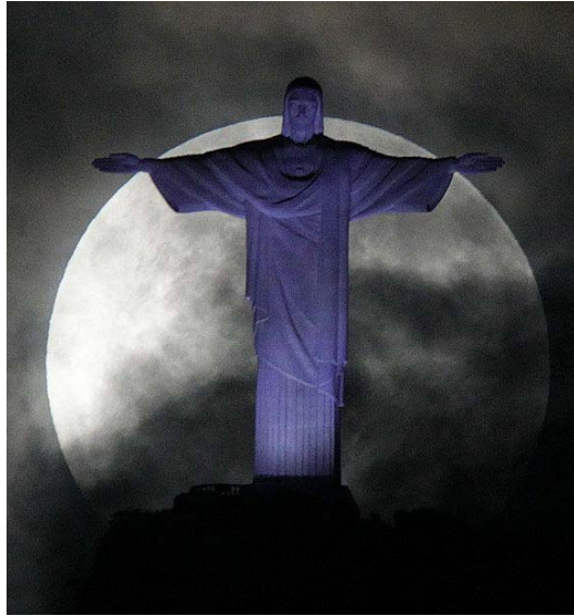
Super moon over Rio de Janeiro