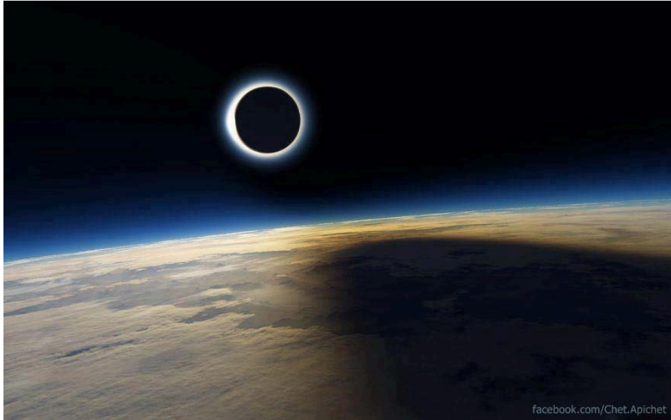
Annular eclipse taken from International Space Station